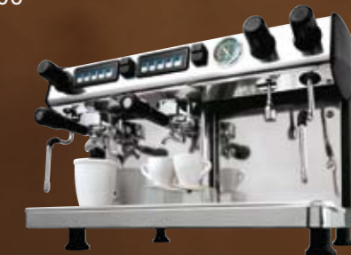
CRISTALLO II Art. no. - 11 301 00