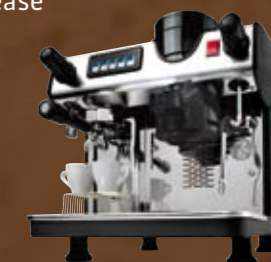
CRISTALLO I/M Art. no. - 11 201 00

For more information, please contact our sales staff or visit www.mv-t.de .